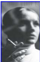
"Please do not smoke In this area"

See how Cig-Arrête® Tobacco Detection Systems can work for you by viewing our demo videos at: