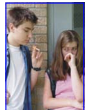
"Smoking in School is not permitted"