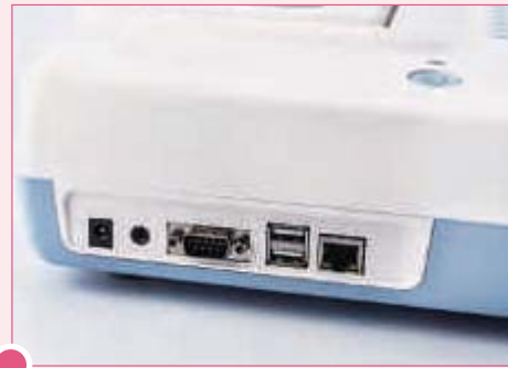
USB port for data export