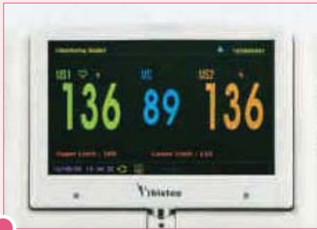
BT-350 LCD Number mode