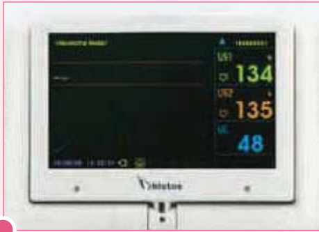
BT-350 LCD Graphic mode